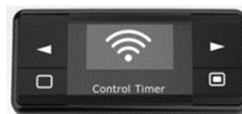
Remote Control Pairing

In the off state, press and hold the left button and return button at the same time for 3 seconds to enter the remote-control matching interface. Press the ON or OFF key of the remote control once at this time, and the interface will show the word OK when the match is successful. If the match is unsuccessful, the word NOK will be displayed. You need to match the remote control again; one timer can match two remote controls at the same time.